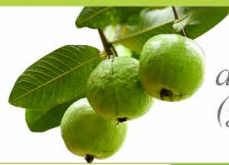
allahabad safeda (guava)